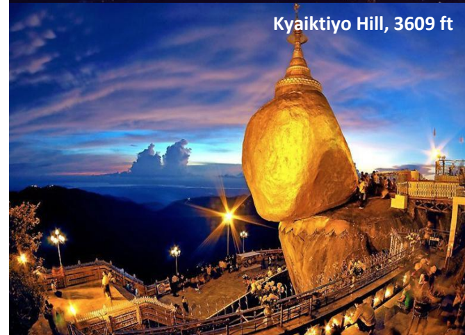
Kyaiktiyo Hill, 3609 ft